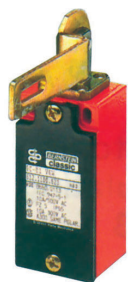
Type GC-VKW 612-1100-623