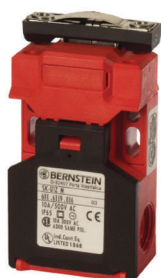
Type SK 601-6119-016