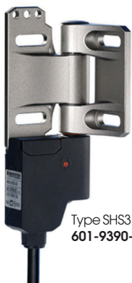
Type SHS3 601-9390-023