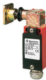
Type GC-VT 612-1100-555