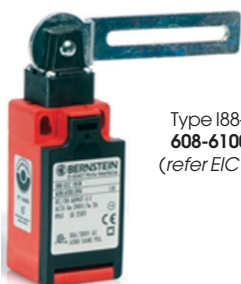
Type I88-VKW 608-6100-094 (refer EIC - POA)