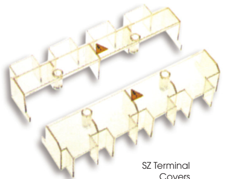
SZ Terminal Covers

Extension Shafts are available but not recommended. Alternative is to space the mounting feet off the mounting plate