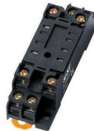
PYF08A-E 10 AMPS 300V