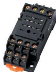
PYF14A-E 7 AMPS 300V